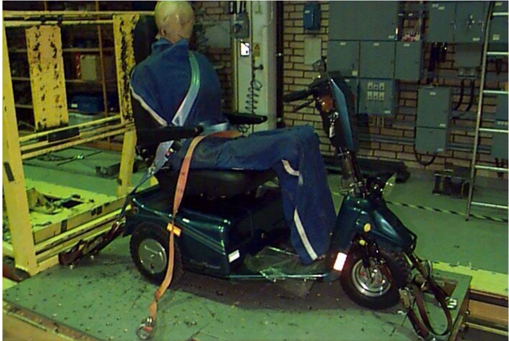
Belt system before test.